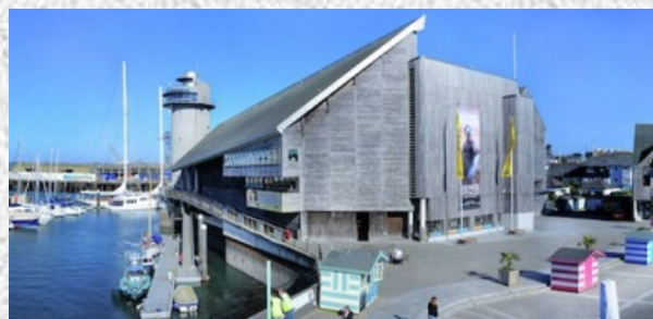
The National Maritime Museum Cornwall

The conference will be held at the National Maritime Museum Cornwall, an independent museum located on Discovery Quay in Falmouth, UK.