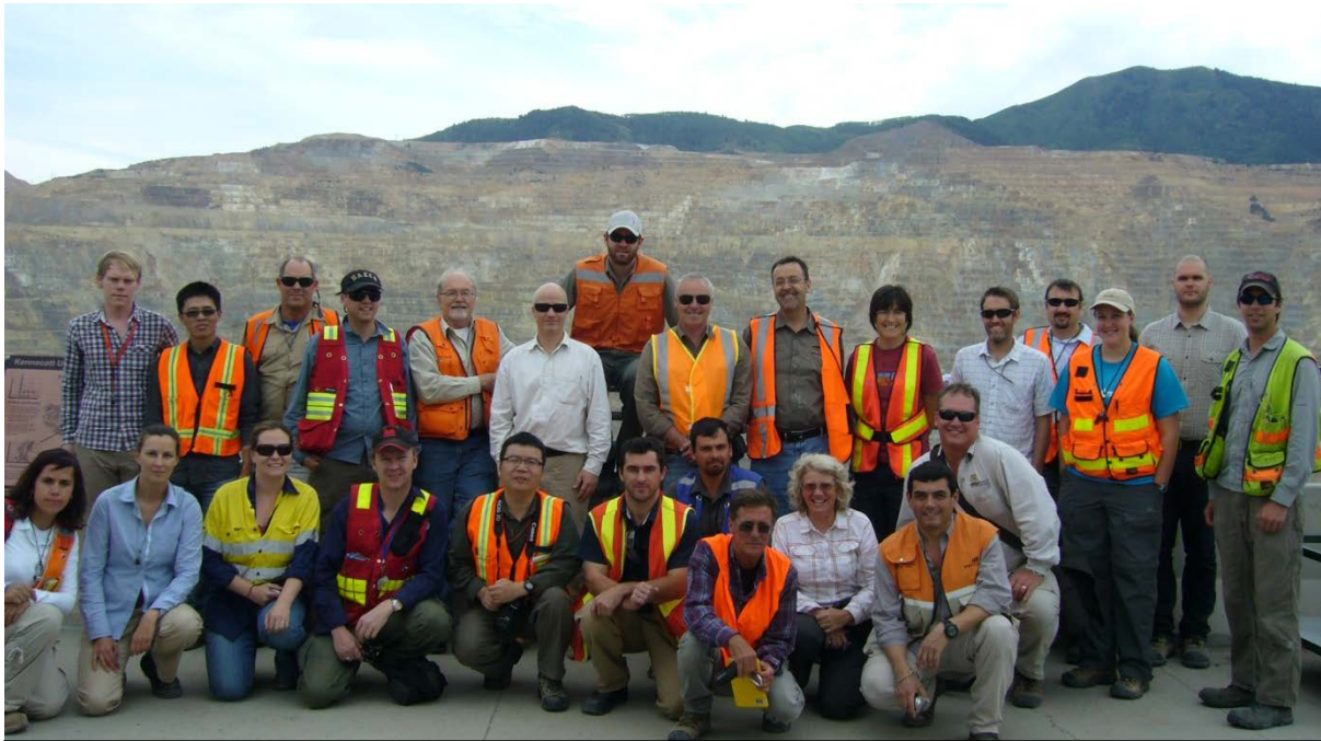
P1060 sponsors and researchers at the visitors centre of Kennecott's Bingham mine.