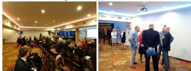
Left pic. – One of presentation room; Right pic. - Poster session

The MEC2017, in addition to its rich program content, was also opportunity for a variety of formal and informal meetings which sought to build scientific and technical co-operation with colleagues sharing their knowledge and best practice. Moreover the program encouraged participation in cultural events: welcome cocktail, ceremonial dinner and regional evening. An interesting part of the Conference was the technical trip to newly built ZGH Boleslaw, which is one of the first European installations for Zinc and Lead recovery delivered from the old flotation tailings.