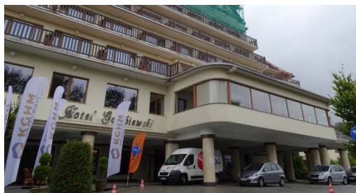
Gołębiewski Hotel - MEC2017 Conference Place

On 20-23 September 2017, next Conference of Mineral Engineering MEC2017 took place in "Gołębiewski" hotel in Wisła.