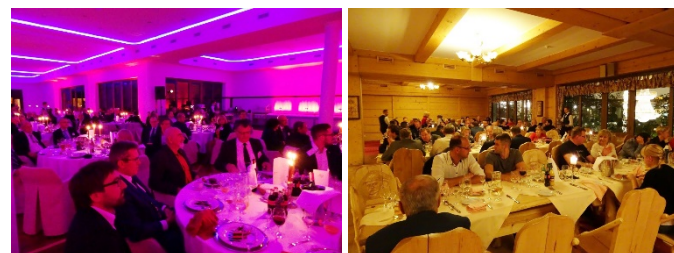
Left pic. - Ceremonial dinner; Right pic. – Regional evening

The MEC2017, in addition to its rich program content, was also opportunity for a variety of formal and informal meetings which sought to build scientific and technical co-operation with colleagues sharing their knowledge and best practice. Moreover the program encouraged participation in cultural events: welcome cocktail, ceremonial dinner and regional evening. An interesting part of the Conference was the technical trip to newly built ZGH Boleslaw, which is one of the first European installations for Zinc and Lead recovery delivered from the old flotation tailings.