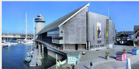
The National Maritime Museum Cornwall

Delegates will have full access to the museum during the conference, with presentations being held in the Sunley Lecture Theatre.